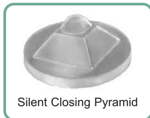
Silent Closing Pyramid