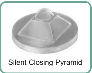
Silent Closing Pyramid